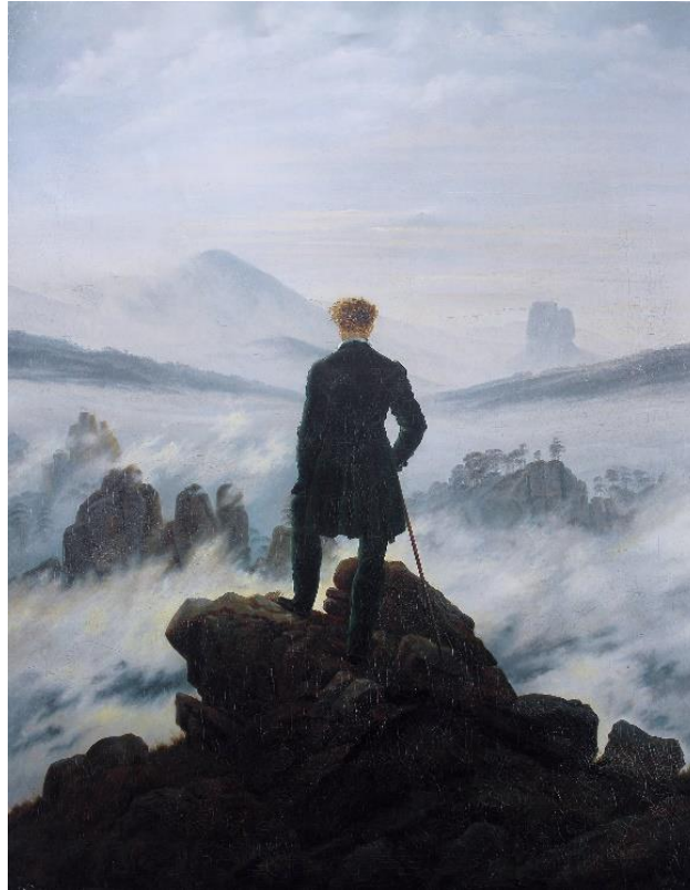
‘Wanderer above the Sea of Fog.’ Caspar David Friedrich, 1818CE

A traveller wearing an overcoat and boots stands on the precipice of a craggy rock face, looking out onto a stark landscape shrouded in mist and clouds. To steady himself, he rests on his cane. If he takes another step, he will plunge to his death, but for now he is safe. The exhilaration he feels as he contemplates the vast expanse before him, which stretches endlessly into the distance, is counter-balanced by the security of his safe footings on the rock face. This, then, is the ‘sublime’ – the coexistence of feelings of terror and wonder, which Friedrich’s beautiful painting captures and which lies at the heart of the late 18 th century literary and cultural movement known as Romanticism.